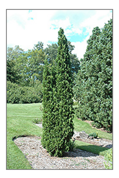
Degroot's Spire Arborvitae