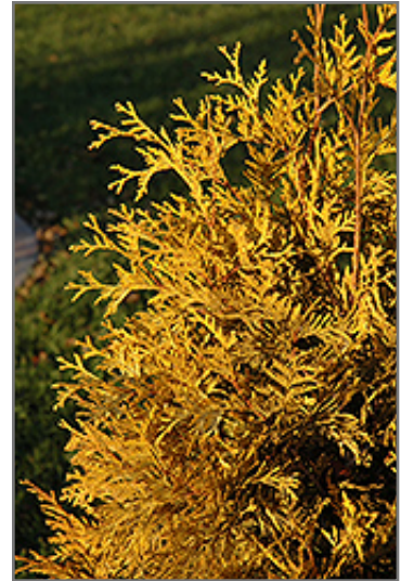
Yellow Ribbon Arborvitae in fall

This shrub does best in full sun to partial shade. It prefers to grow in average to moist conditions, and shouldn't be allowed to dry out. It is not particular as to soil type or pH. It is somewhat tolerant of urban pollution, and will benefit from being planted in a relatively sheltered location. Consider applying a thick mulch around the root zone in winter to protect it in exposed locations or colder microclimates. This is a selection of a native North American species.