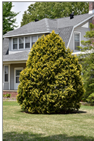
Yellow Ribbon Arborvitae