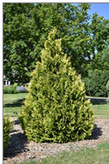
Yellow Ribbon Arborvitae