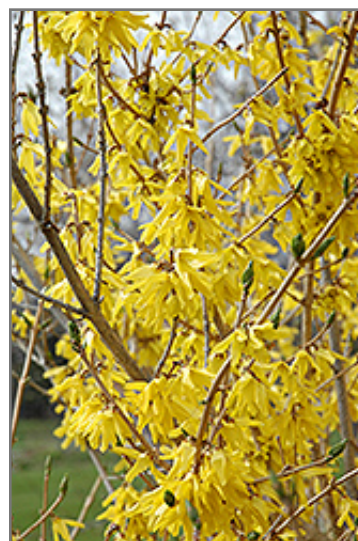
Northern Gold Forsythia flowers