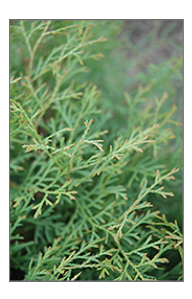
Sherwood Moss Arborvitae foliage