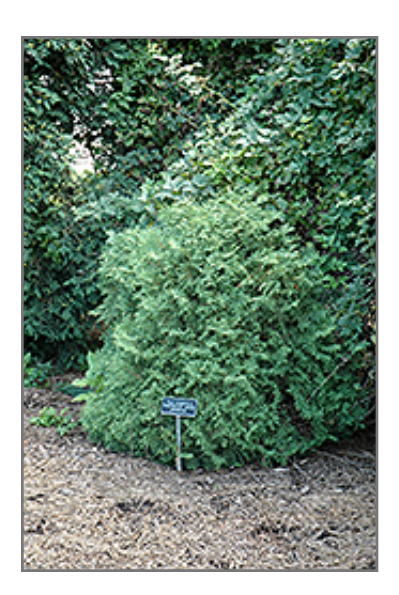
Sherwood Moss Arborvitae