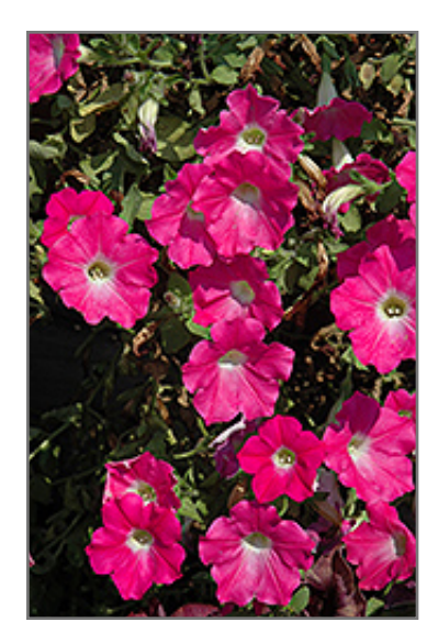
Supertunia Mini Bright Pink Petunia flowers

Supertunia Mini Bright Pink Petunia is bathed in stunning hot pink trumpet-shaped flowers with white centers at the ends of the stems from mid spring to mid fall. Its pointy leaves remain green in colour throughout the season.