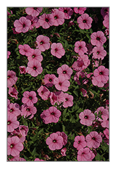
Supertunia Flamingo Petunia flowers

Supertunia Flamingo Petunia is draped in stunning pink trumpet-shaped flowers at the ends of the stems from mid spring to mid fall. Its pointy leaves remain green in colour throughout the season.