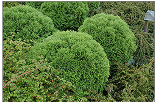
Little Giant Arborvitae