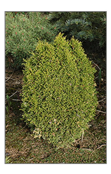
Boisbriand Arborvitae