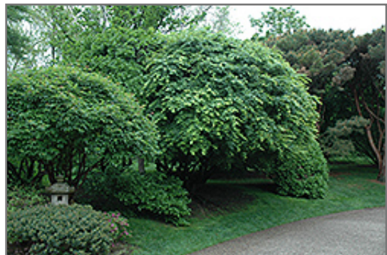
Japanese Maple