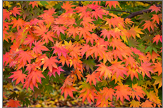
Japanese Maple in fall