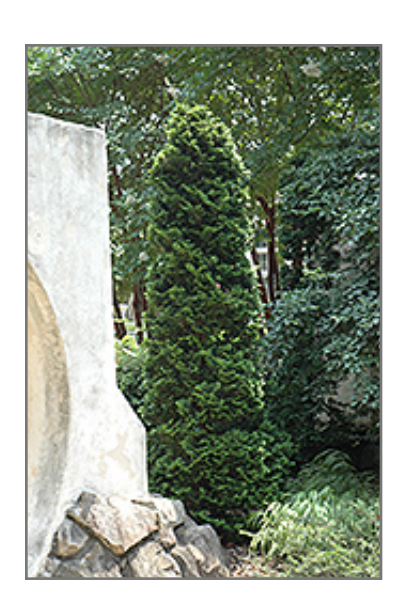
Dark Green Arborvitae

Dark Green Arborvitae will grow to be about 20 feet tall at maturity, with a spread of 7 feet. It has a low canopy with a typical clearance of 1 foot from the ground, and is suitable for planting under power lines. It grows at a slow rate, and under ideal conditions can be expected to live for 50 years or more.