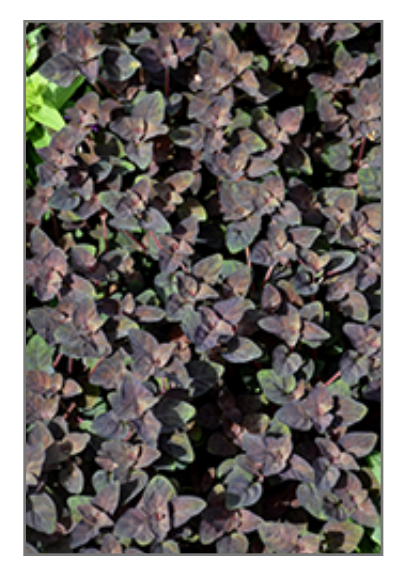
Persian Chocolate Loosestrife foliage