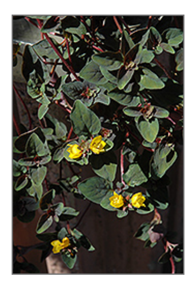
Persian Chocolate Loosestrife flowers

Persian Chocolate Loosestrife is recommended for the following landscape applications;