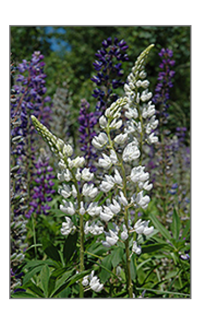
White Lupine flowers

A valued native variety producing spikes of graceful white blooms; a tremendous visual impact massed in the garden, border plantings or in containers