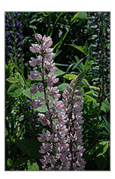
Pink Lupine flowers

A valued native variety producing elegant spikes of lovely pink blooms; a tremendous visual impact massed in the garden, border plantings or in containers