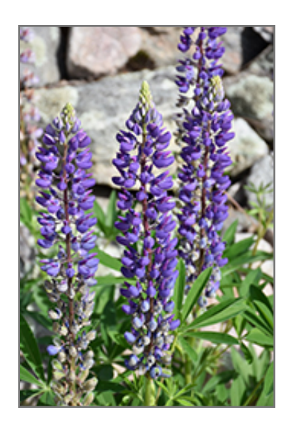
Blue Lupine flowers

A valued native variety producing spikes of eye catching flowers of blue-violet; a tremendous visual impact massed in the garden, border plantings or in containers