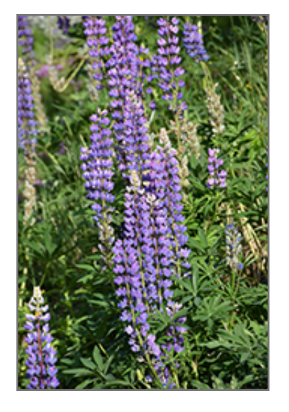
Wild Lupine flowers