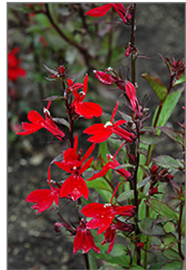
Fan Scarlet Cardinal Flower flowers