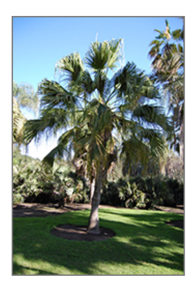
Chinese Fan Palm

This tropical plant does best in full sun to partial shade. It prefers to grow in average to moist conditions, and shouldn't be allowed to dry out. It is not particular as to soil type or pH. It is somewhat tolerant of urban pollution. This species is not originally from North America.