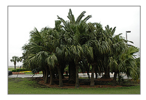
Chinese Fan Palm

Chinese Fan Palm is a fine choice for the yard, but it is also a good selection for planting in outdoor pots and containers. Because of its height, it is often used as a 'thriller' in the 'spiller-thriller-filler' container combination; plant it near the center of the pot, surrounded by smaller plants and those that spill over the edges. It is even sizeable enough that it can be grown alone in a suitable container. Note that when grown in a container, it may not perform exactly as indicated on the tag - this is to be expected. Also note that when growing plants in outdoor containers and baskets, they may require more frequent waterings than they would in the yard or garden. Be aware that in our climate, most plants cannot be expected to survive the winter if left in containers outdoors, and this plant is no exception. Contact our experts for more information on how to protect it over the winter months.