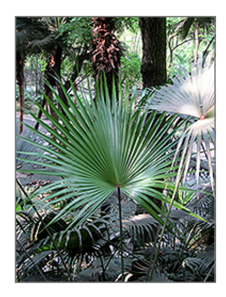
Chinese Fan Palm foliage