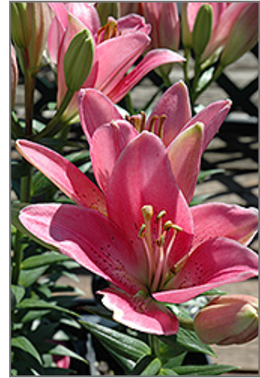
Turandot Lily flowers