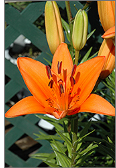
Tresor Lily flowers