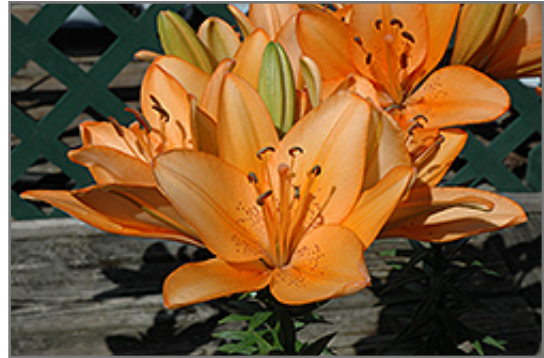
Orange Tycoon Lily flowers