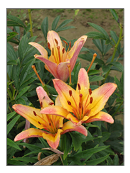
Ladylike Lily flowers

A lovely upward facing bloom that features pink petals with wide golden centers; a very noticeable summer presentation for borders, gardens or containers