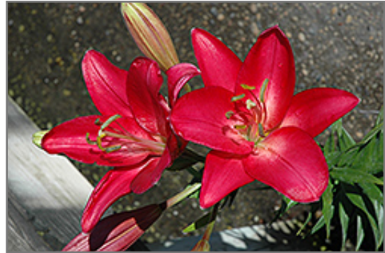
Koures Lily flowers