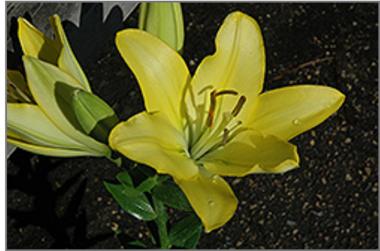
Freya Lily flowers