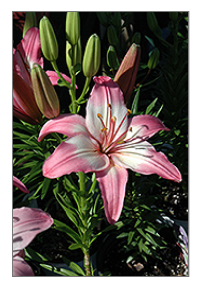
Ay Caramba Lily flowers

A dazzling upward facing bloom that features silky white petals with shocking hot pink tips; a very noticeable mid summer presentation for borders, gardens or containers