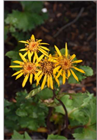
Osiris Cafe Noir Rayflower flowers