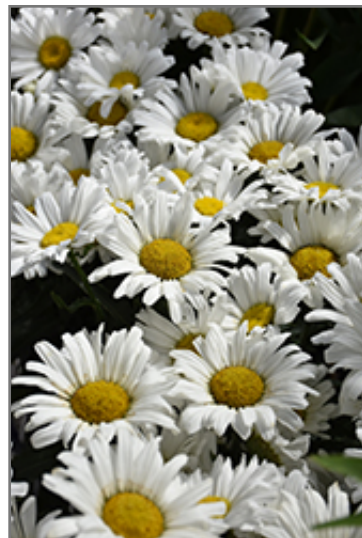
Daisy May Shasta Daisy flowers

Daisy May Shasta Daisy is recommended for the following landscape applications;