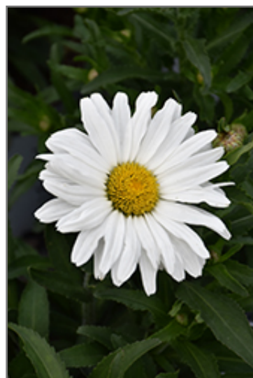
Daisy May Shasta Daisy flowers