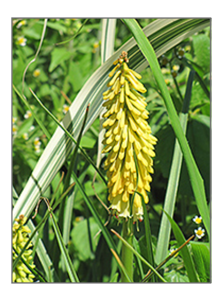
Yellow Hammer Torchlily flowers

An excellent, long blooming variety with stunning, large yellow flower stalks, creating an unusual border or container planting; makes a great cutflower and attracts hummingbirds