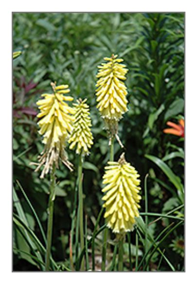
Primrose Beauty Torchlily flowers

Soft yellow flowers rise from grassy, evergreen foliage in midsummer to create a pleasing border or container planting; makes a great cutflower and attracts hummingbirds