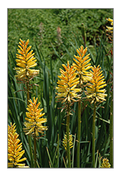
Gold Mine Torchlily flowers

Bold yellow-gold flowers rise from grassy, evergreen foliage in summer to create an unusual border or container planting; makes a great cutflower and attracts hummingbirds