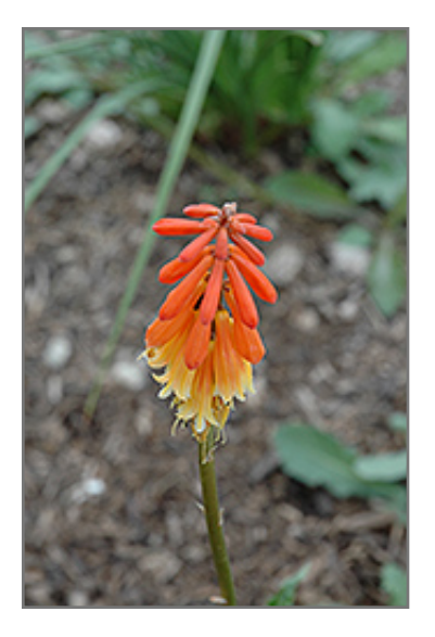
Elvira Torchlily flowers