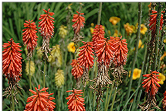
Bressingham Comet Torchlily flowers