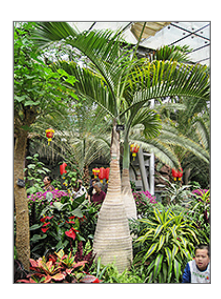
Bottle Palm

Bottle Palm is a fine choice for the yard, but it is also a good selection for planting in outdoor pots and containers. Because of its height, it is often used as a 'thriller' in the 'spiller-thriller-filler' container combination; plant it near the center of the pot, surrounded by smaller plants and those that spill over the edges. It is even sizeable enough that it can be grown alone in a suitable container. Note that when grown in a container, it may not perform exactly as indicated on the tag - this is to be expected. Also note that when growing plants in outdoor containers and baskets, they may require more frequent waterings than they would in the yard or garden. Be aware that in our climate, most plants cannot be expected to survive the winter if left in containers outdoors, and this plant is no exception. Contact our experts for more information on how to protect it over the winter months.