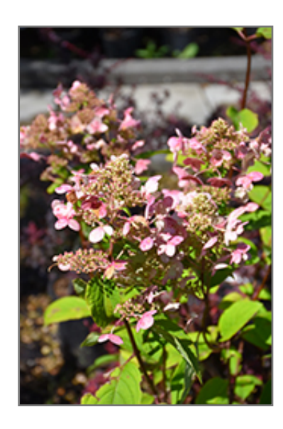
Fire And Ice Hydrangea flowers

This shrub performs well in both full sun and full shade. It prefers to grow in average to moist conditions, and shouldn't be allowed to dry out. It is not particular as to soil type or pH. It is highly tolerant of urban pollution and will even thrive in inner city environments. Consider applying a thick mulch around the root zone in winter to protect it in exposed locations or colder microclimates. This is a selected variety of a species not originally from North America.