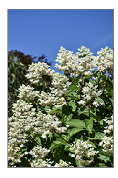
Fire And Ice Hydrangea flowers

Fire And Ice Hydrangea is recommended for the following landscape applications;