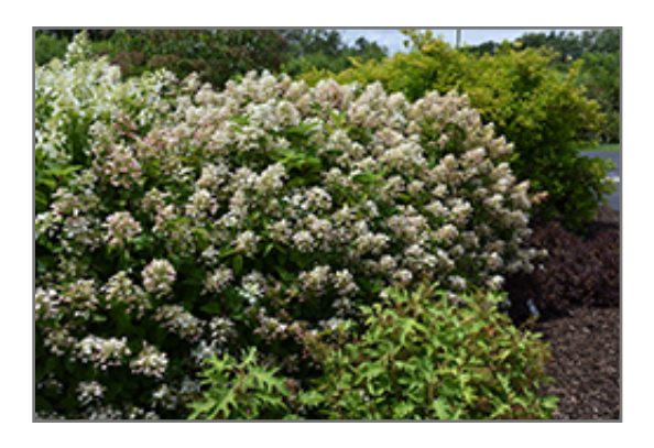
Fire And Ice Hydrangea in bloom