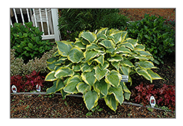
Shadowland Seducer Hosta