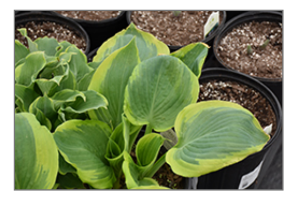
Shadowland Seducer Hosta foliage