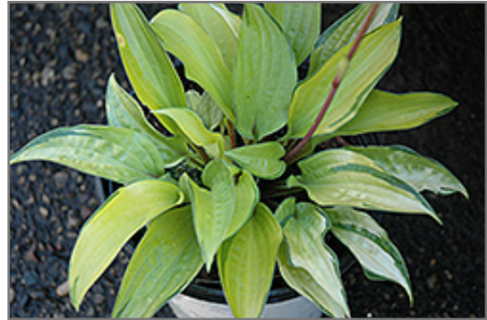
Paradise Island Hosta foliage