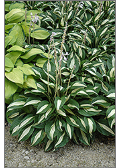
Lemon Juice Hosta