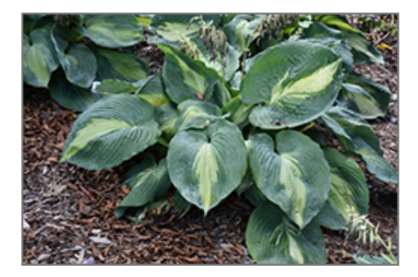
Shadowland Hudson Bay Hosta

This is a relatively low maintenance plant, and is best cleaned up in early spring before it resumes active growth for the season. Gardeners should be aware of the following characteristic(s) that may warrant special consideration;