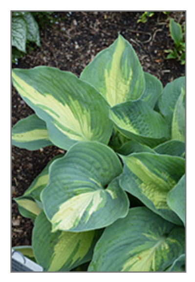
Shadowland Hudson Bay Hosta foliage

Shadowland Hudson Bay Hosta is a dense herbaceous perennial with tall flower stalks held atop a low mound of foliage. Its medium texture blends into the garden, but can always be balanced by a couple of finer or coarser plants for an effective composition.