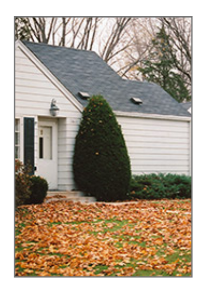
Upright Japanese Yew