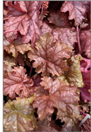
Carnival Peach Parfait Coral Bells foliage

Carnival Peach Parfait Coral Bells is recommended for the following landscape applications;