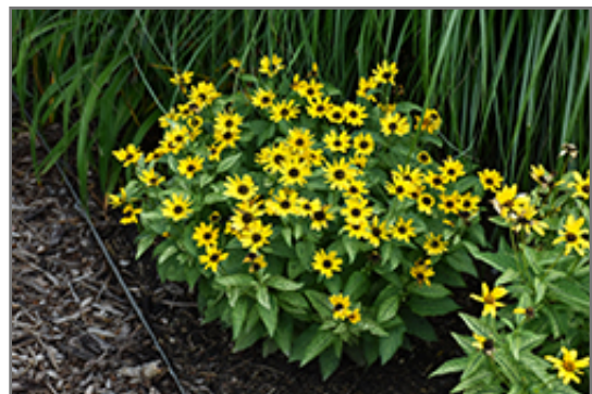
Sunburst False Sunflower in bloom