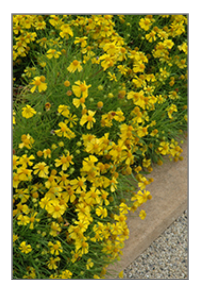
Dakota Gold Sneezeweed flowers

A great summer and fall bloomer that brightens the garden with its sunny golden-yellow flowers when everything else starts to fade; adapts to most soils; regular watering needed