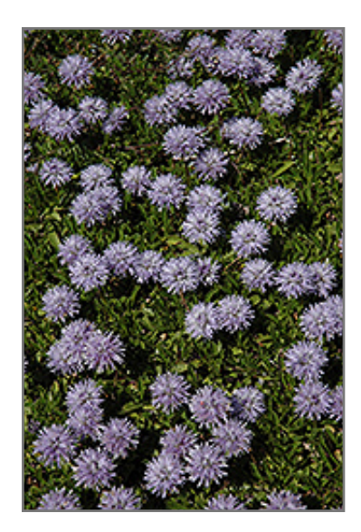
Miniature Globe Daisy flowers

This is a low growing, carpeting species with showy spherical lavender-blue flowers over many weeks in spring; adaptable and easy to grow, forming a dense mat; great for rock gardens; hardy and vigorous