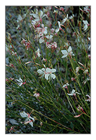
White Dove Gaura flowers

This stunning variety produces large, paper-white blooms on a compact plant that is great for containers; attractive to butterflies; tolerant of heat, drought and humidity; non-flopping type