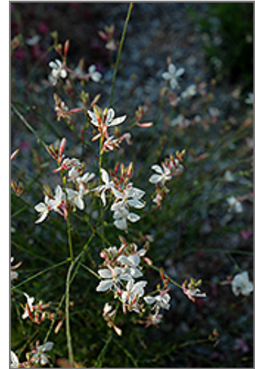
Ballerina White Gaura flowers

This is a relatively low maintenance plant, and is best cleaned up in early spring before it resumes active growth for the season. It is a good choice for attracting butterflies to your yard, but is not particularly attractive to deer who tend to leave it alone in favor of tastier treats. It has no significant negative characteristics.