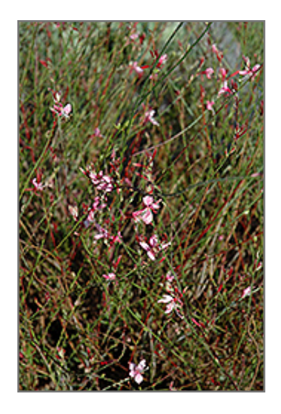
Ballerina Lilac Gaura flowers