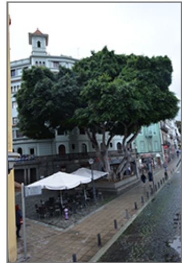
Indian Laurel Fig

Indian Laurel Fig is a multi-stemmed evergreen tree with a more or less rounded form. Its average texture blends into the landscape, but can be balanced by one or two finer or coarser trees or shrubs for an effective composition.