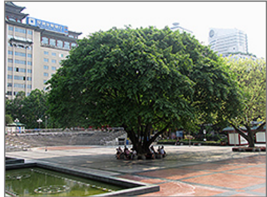
Indian Laurel Fig