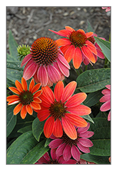
Sombrero Hot Coral Coneflower flowers

Sombrero Hot Coral Coneflower is an herbaceous perennial with an upright spreading habit of growth. Its medium texture blends into the garden, but can always be balanced by a couple of finer or coarser plants for an effective composition.