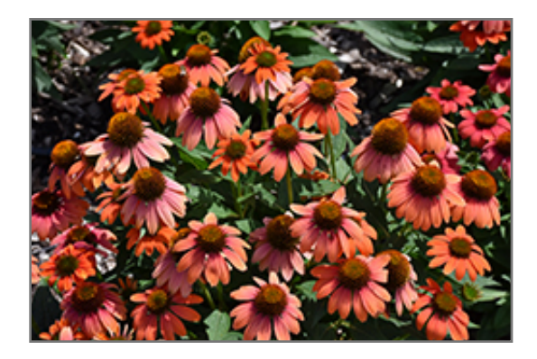
Sombrero Hot Coral Coneflower flowers

This is a relatively low maintenance plant, and is best cleaned up in early spring before it resumes active growth for the season. It is a good choice for attracting butterflies to your yard, but is not particularly attractive to deer who tend to leave it alone in favor of tastier treats. It has no significant negative characteristics.