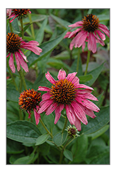
Mama Mia Coneflower flowers