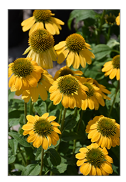
Leilani Coneflower flowers