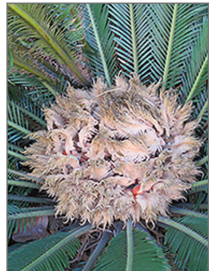
Japanese Sago Palm flowers