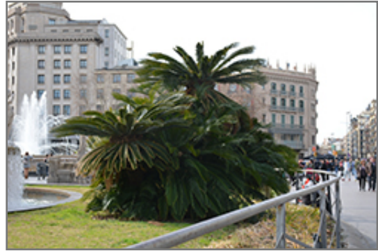
Japanese Sago Palm

Japanese Sago Palm is a fine choice for the garden, but it is also a good selection for planting in outdoor pots and containers. Because of its height, it is often used as a 'thriller' in the 'spiller-thriller-filler' container combination; plant it near the center of the pot, surrounded by smaller plants and those that spill over the edges. It is even sizeable enough that it can be grown alone in a suitable container. Note that when growing plants in outdoor containers and baskets, they may require more frequent waterings than they would in the yard or garden. Be aware that in our climate, most plants cannot be expected to survive the winter if left in containers outdoors, and this plant is no exception. Contact our experts for more information on how to protect it over the winter months.