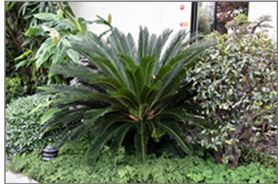
Japanese Sago Palm

This plant does best in full sun to partial shade. It does best in average to evenly moist conditions, but will not tolerate standing water. It is not particular as to soil pH, but grows best in sandy soils. It is somewhat tolerant of urban pollution. Consider applying a thick mulch around the root zone in winter to protect it in exposed locations or colder microclimates. This species is not originally from North America, and parts of it are known to be toxic to humans and animals, so care should be exercised in planting it around children and pets.